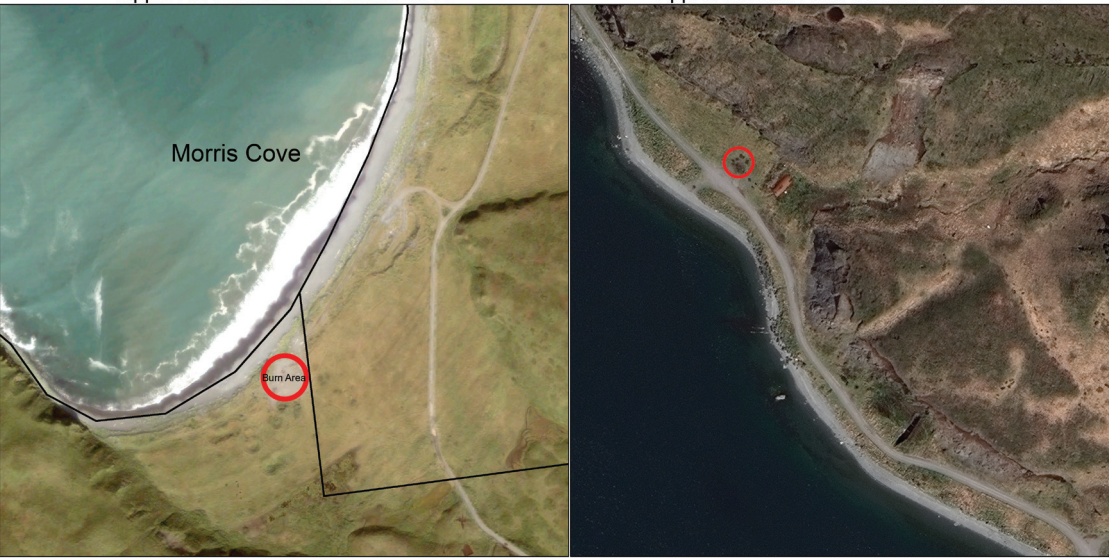
Approved Burn Area at Little South America